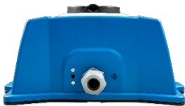
EV Charging Station - Back