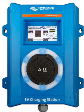
EV Charging Station